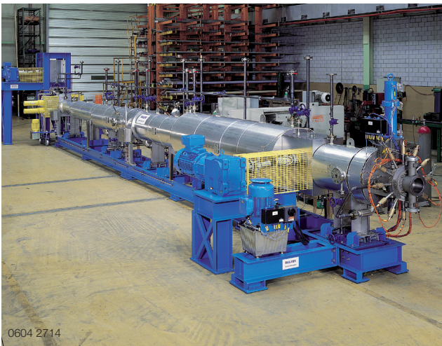
0604 2714 Sulzer EPS Unit ready for shipment

The Sulzer EPS Process is, contrary to the conventional suspension polymerization process, a fully continuous production process for expandable polystyrene. The foaming agent, which can be the same as in the suspension process (i.e. pentane), is injected in liquid form and at high pressure into polystyrene melt.