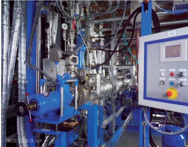
EPS Pilot Unit at Sulzer facilities in Winterthur

The cooled, highly viscous mixture is then pelletized in an under-water pelletizing system. The dried and separated EPS micropellets are finally conveyed to silos or containers. The whole process is carried out under conditions which avoid any premature foaming.