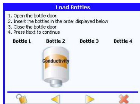
Fully compliant conductivity meter