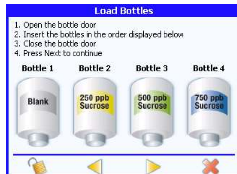
Built-in, automated SOPs