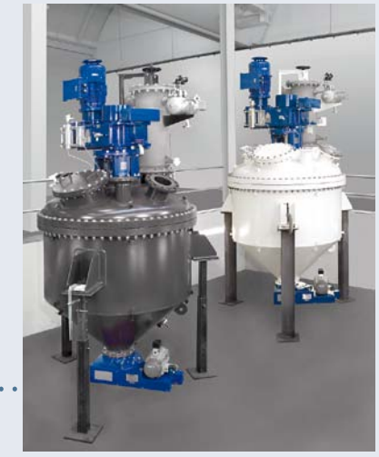
EKATO SOLIDMIX VSM 2500