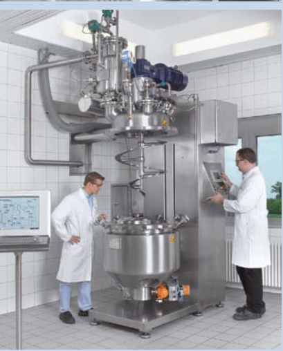
Customers have the possibility to test and optimize their processes on all SOLIDMIX unit types in the EKATO SYSTEMS test facility.